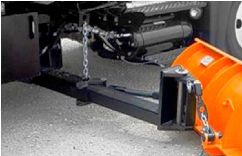
Extension cylinder mounted inside the cross tube for protection from road debris. Lift arm design eliminates slide construction which can bind.