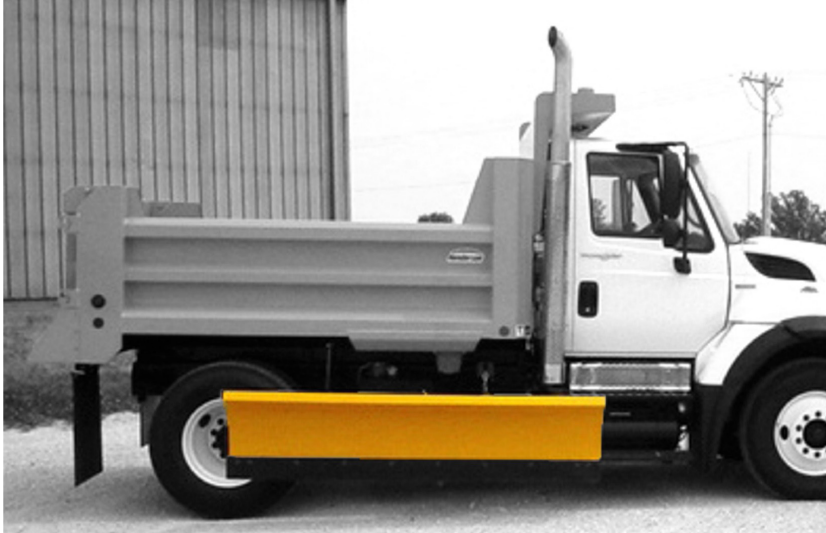
Unit tucks straight back for minimal interference, leaves room on body for ladders, shovel holders, tarp hooks, etc...