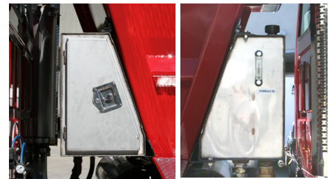
Trapezoidal tool box