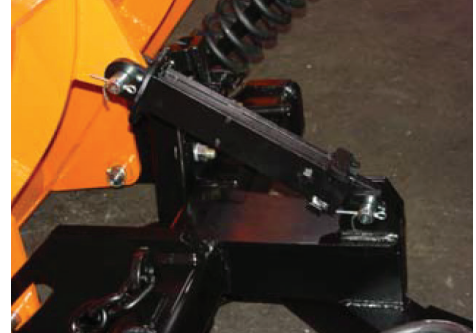
Adjustable pitch radius arm.