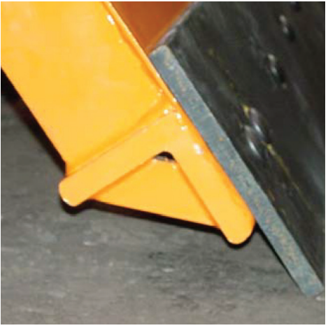
4" x 4" x 3/4" fully reinforced bottom angle